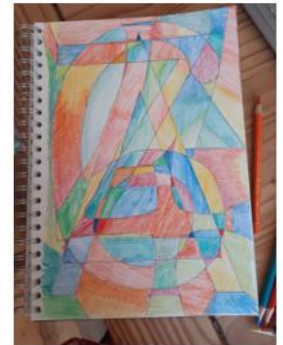
Year 8 Zakk Elwell is one of the most improved artists during remote learning showing a more positive attitude to learning. This completed piece is an outstanding piece of project work. Well done Zakk from a very proud art teacher!