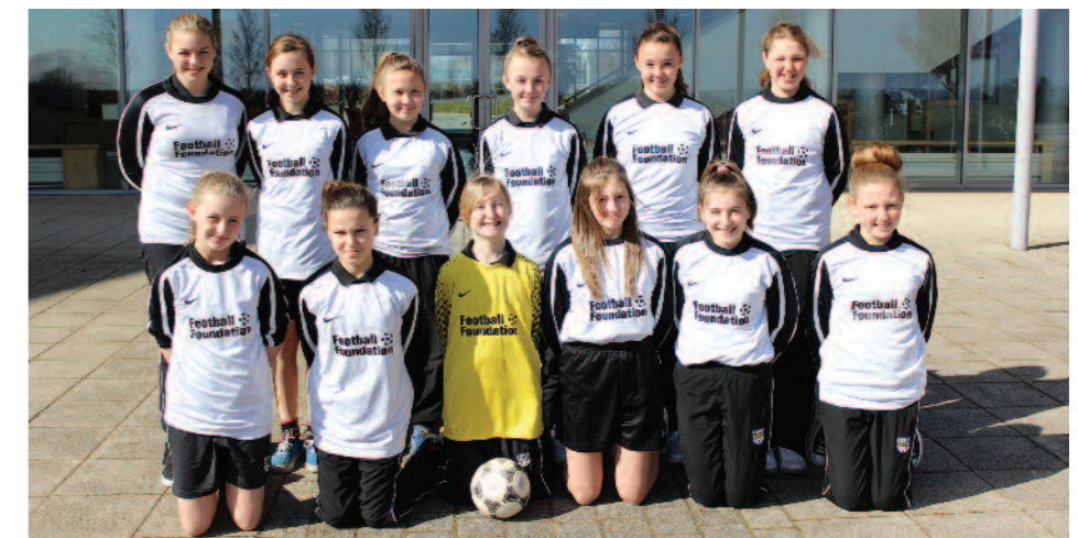
Under 13 Girls' Football Team

So far this season the girls have played immensely well and at the time of writing remain unbeaten! They are already well on their way to win their group, which will see them play the Winners of Group B to compete for the Solihull League Title. They are also through to the Semi-Final of the Solihull Cup. The girls also recently took part in the North Solihull Under 13 Football Championships where they ended up as Runners-Up. Good luck to the girls for the rest of the season and let's bring home a resounding Park Hall win!