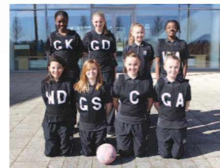
Year 8 Girls' Netball Team

The girls still have a number of matches to play against challenging teams like Langley School and Grace Academy this term. There's also an upcoming tournament at Lode Heath where, I have no doubt, they will notch up some solid wins as they progress, both as players and as a team.