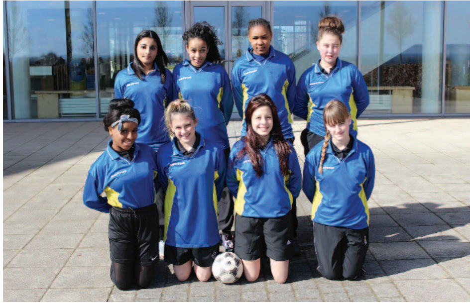
Under 15 Girls' Football Team