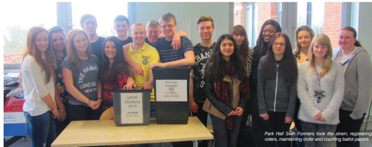
Park Hall Sixth Formers took the strain; registering voters, maintaining order and counting ballot papers.