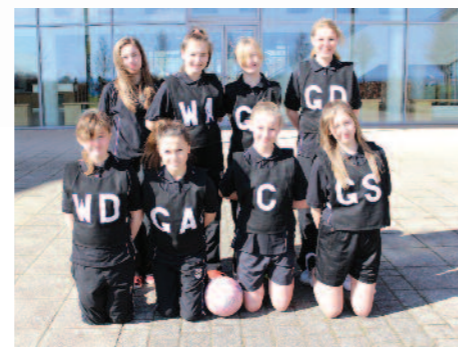
Year 7 Girls' Netball Team

The Team achieved their first win against John Henry Newman where they won 4-2. The girls were ecstatic with this first win on the books and are looking forward to more as the year progresses. Good luck for the rest of the season!