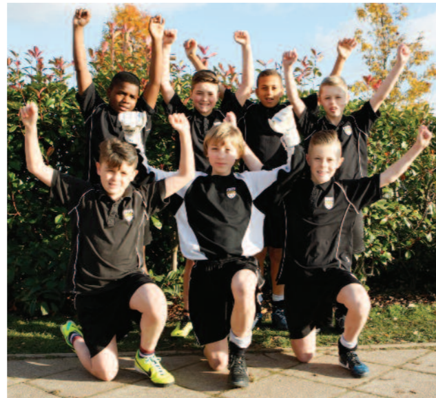
Year 7 Boys' Seven-a-Side Football Team

The hard work and expertise of our Year 10 GCSE students was greatly appreciated at the North Solihull Indoor Athletics Championships recently. They were given the responsibility of Marshalling, Officiating and Collating the Results for this important event. They all did a simply fantastic job and were great ambassadors for our school.