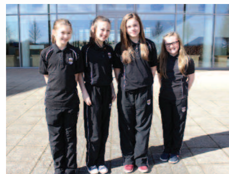
Year 7 Girls' Trampolining Team

Well done to all the students involved, we look forward to hearing about your future triumphs!