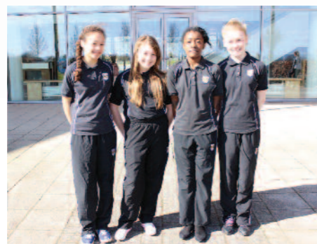
Year 8 Girls' Trampolining Team

With a few friendly matches ahead and a tournament at Lode Heath School on the way, the girls are looking forward to what the rest of the season will bring. Well done to the girls so far and good luck for the rest of the season!