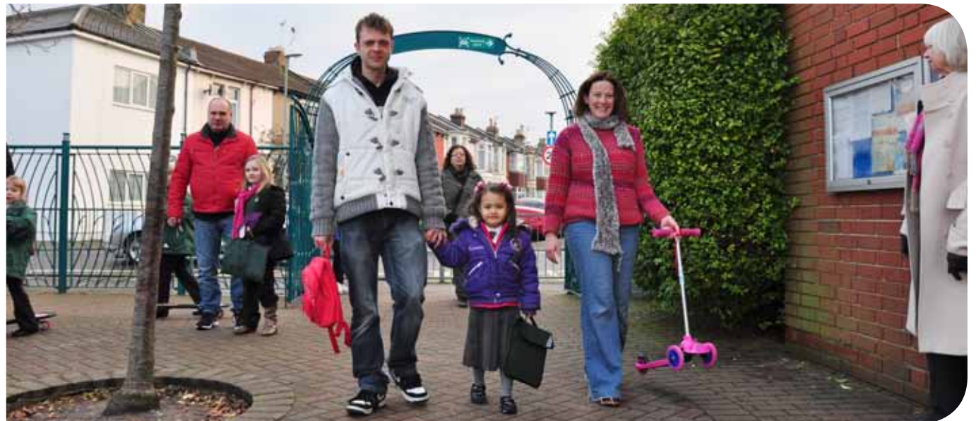
Gathering parents' views electronically can save time and save the environment.

If a school has any concerns, the headteacher/principal or the appropriate authority should contact enquiries@ofsted.gov.uk