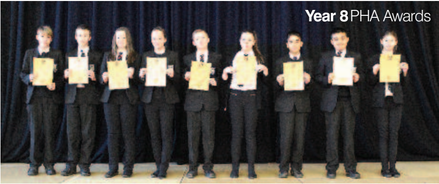
Year 8 PHA Awards