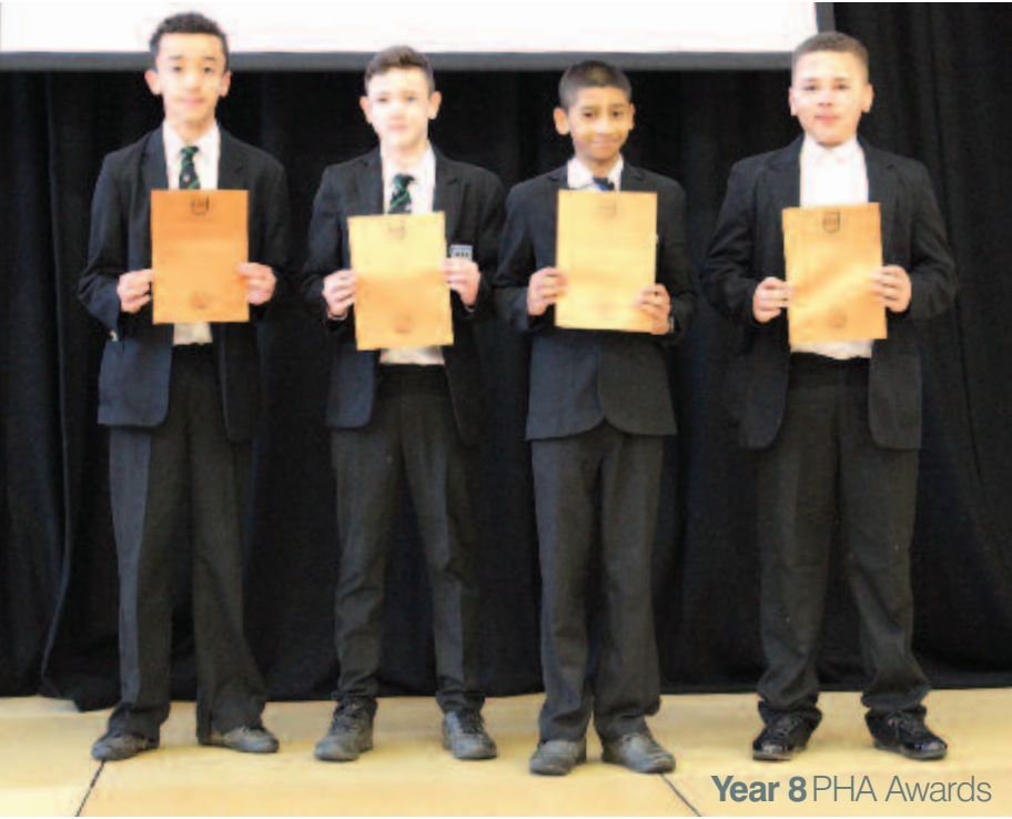
Year 8 PHA Awards