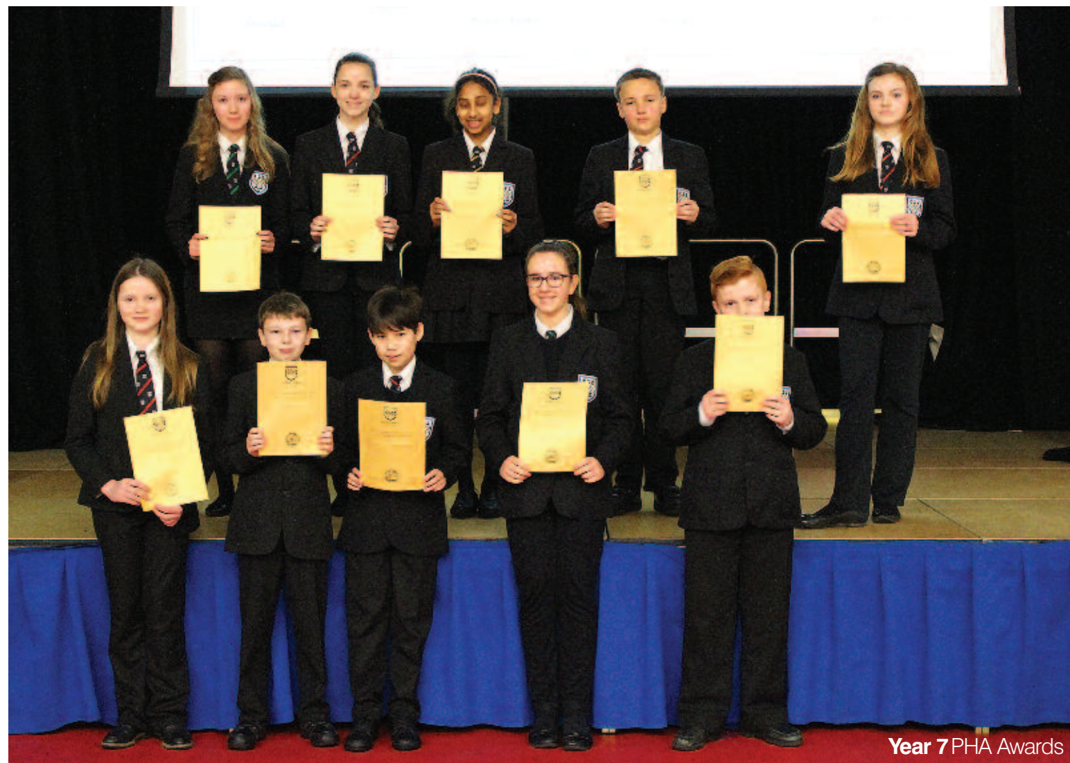
Year 7 PHA Awards