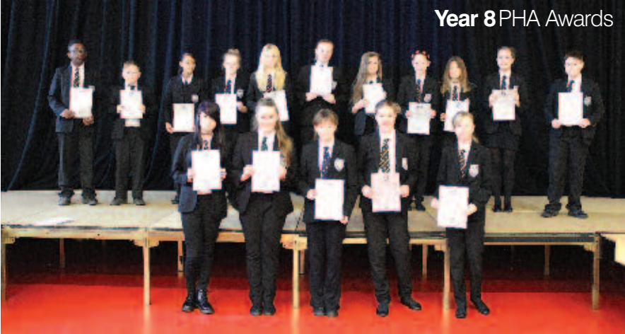
Year 8 PHA Awards