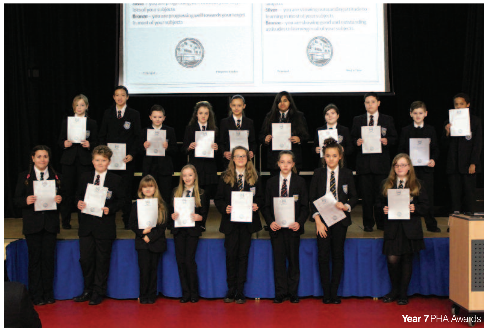
Year 7 PHA Awards