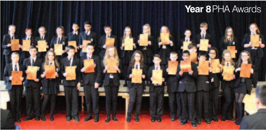
Year 8 PHA Awards