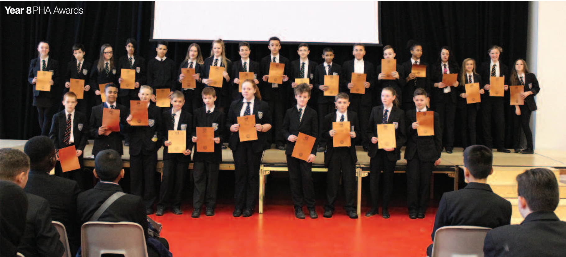
Year 8 PHA Awards