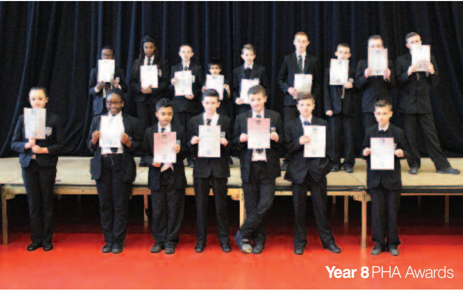
Year 8 PHA Awards