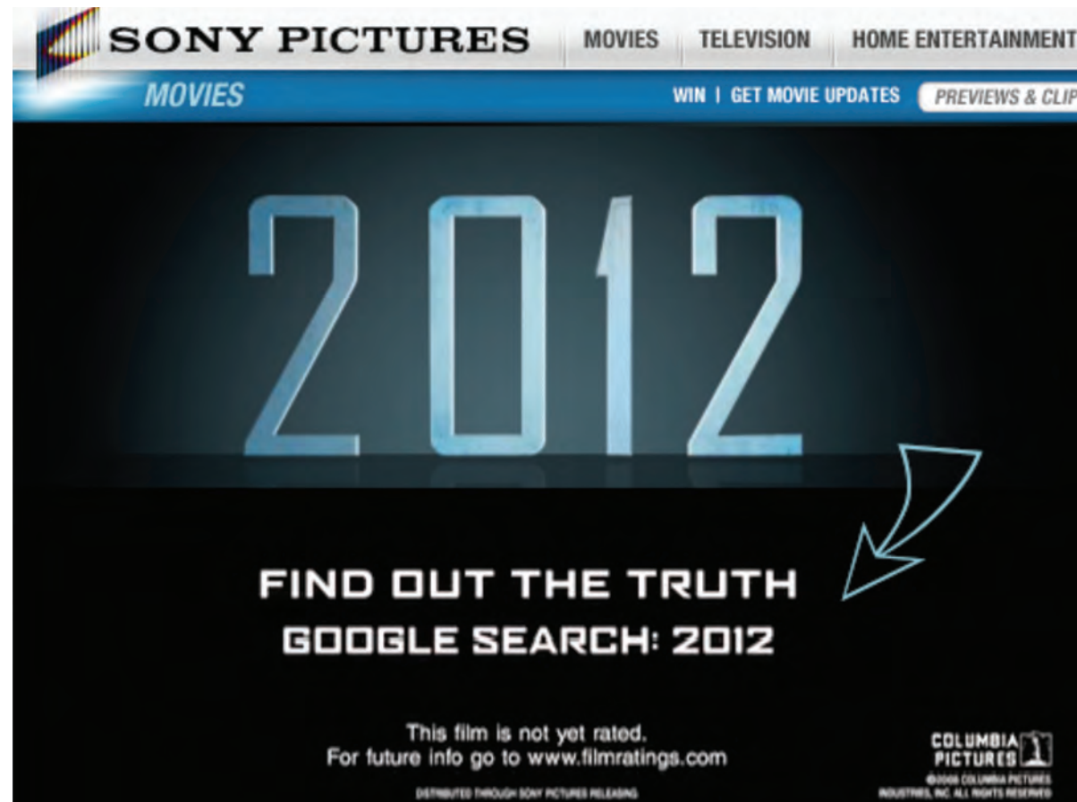
A 'teaser' website, posted 21 November, 2008

2012: a selection of publicity materials issued by Sony Pictures weeks or months in advance of the film's November 2009 release