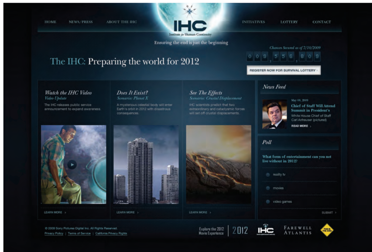
A linked pre-release website

A series of teaser posters, also issued as a set of free postcards and as magazine adverts